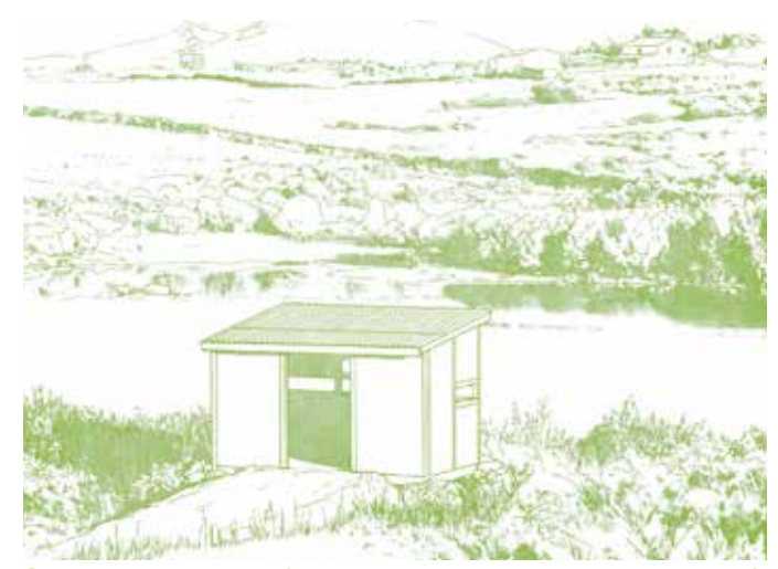
One of the two observatories of the path: follow the banks of the reservoir of the Póvoa Dam, with your eyes on the birds.

The construction of the Póvoa Dam (1927) created a water surface of 236 hectares, the perimeter of which this pathway will allow us to accompany in part. Starting out at the Service Area for Motor Caravans, we soon come across the Necropolis of Boa Morte (Good Death), an indication that the territory is rich in archaeological sites. At the entrance to the dam wall we make a detour to visit the area downstream: a water mill and a rural shelter (chafurdão) are evidences of old rural constructions and the activities that were carried out here. At the end of the wall we follow the path along the line that corresponds to the maximum water storage level of the dam. As we pass close to the municipal road, we come across in its verge a well-preserved anthropomorphic grave. We remain along the verge of the road to the point where a bird observatory awaits us. It is time to take the binoculars from the backpacks. From here, we leave the reservoir a little ways in order to cross an area of oak forest where the granite appears in outcroppings, in loose boulders or in crudely stacked stone walls. The last part of the path follows unpaved dirt roads, ending at a second observatory where we can take the opportunity to say goodbye to the dam and its birdlife.